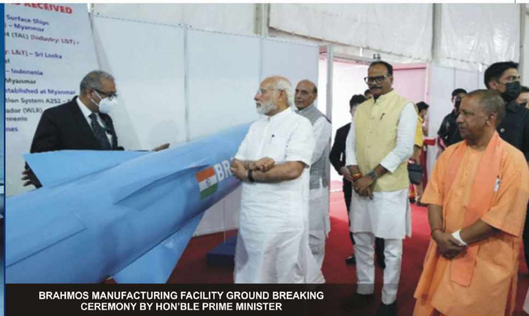
BRAHMOS MANUFACTURING FACILITY GROUND BREAKING CEREMONY BY HON'BLE PRIME MINISTER