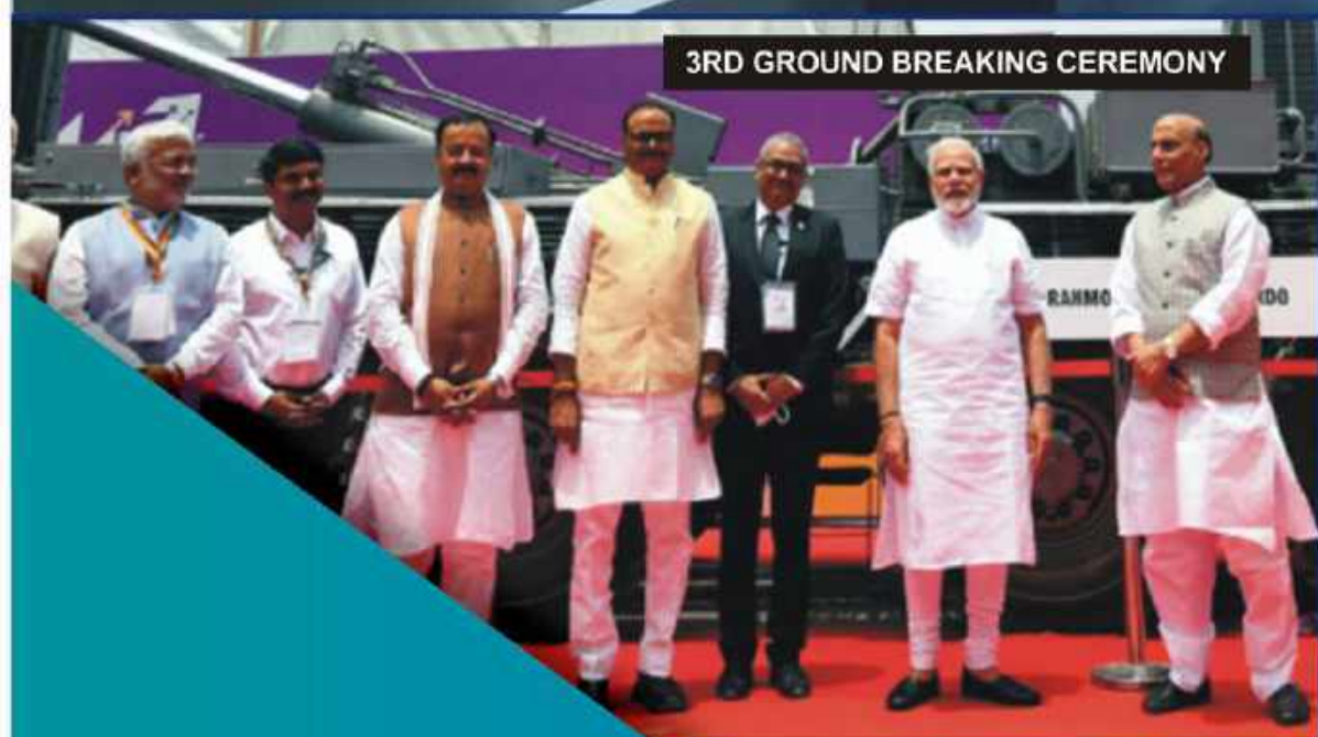
3RD GROUND BREAKING CEREMONY