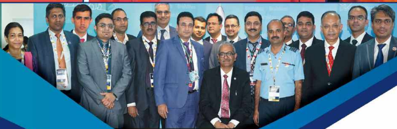
CONTINUOUSLY MOTIVATING YOUNG MINDS