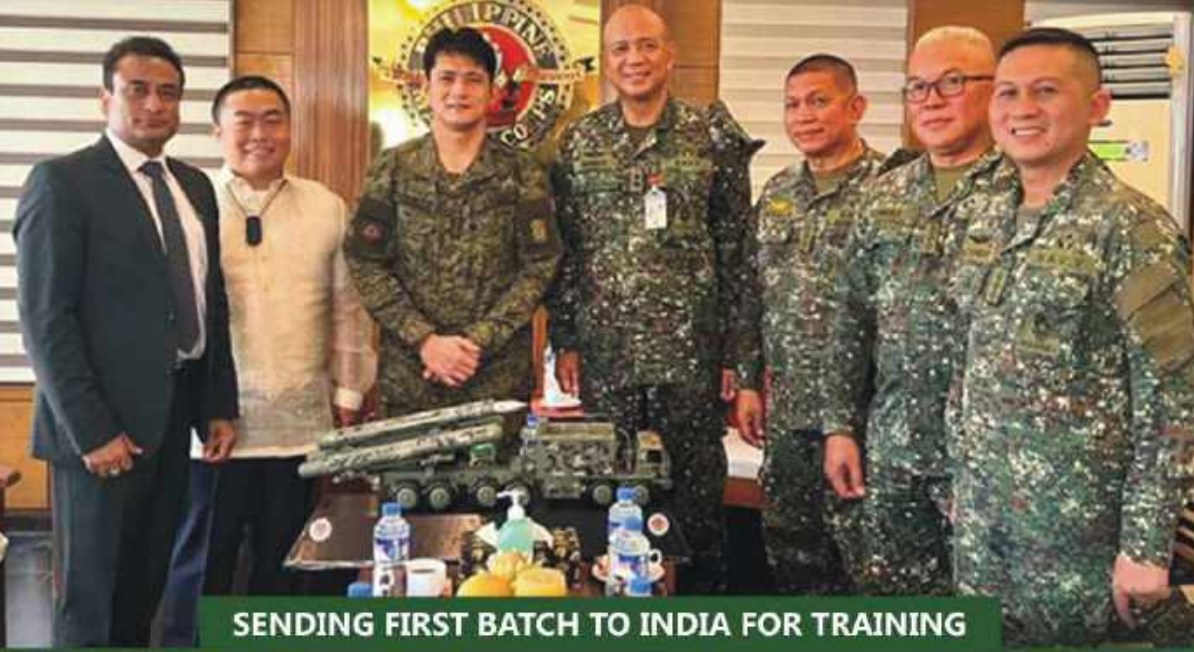
SENDING FIRST BATCH TO INDIA FOR TRAINING