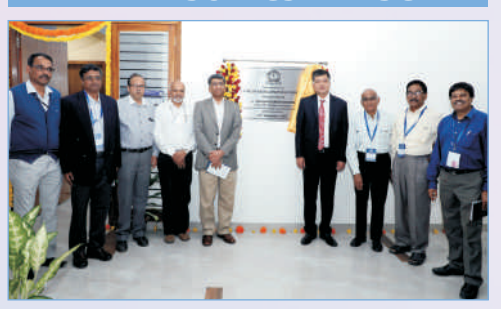
Centre for Excellence in Hypersonics inaugurated by CEO&MD BrahMos at Indian Institute of Science, Bengaluru