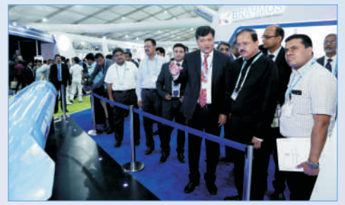
Dr. Subhash Bhamre, Minister of State for Defence