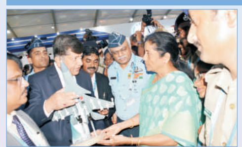
Defence Minister of India Smt Nirmala Sitharaman