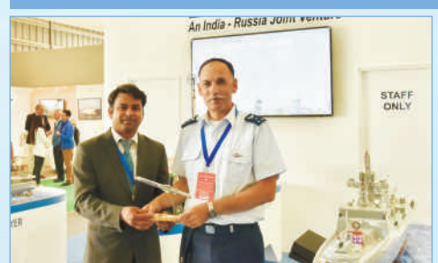
Head of Logistics Command, Chilean Air Force