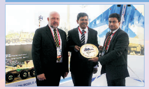
Ambassador of India to Kazakhstan