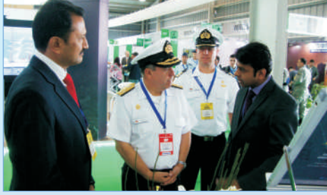
Chief of Chilean Navy