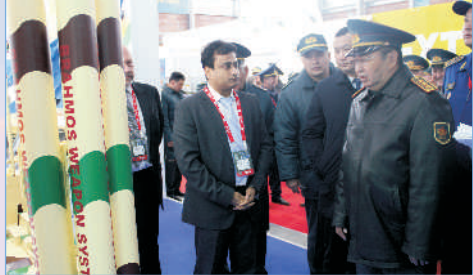
Defence Minister of the Republic of Kazakhstan