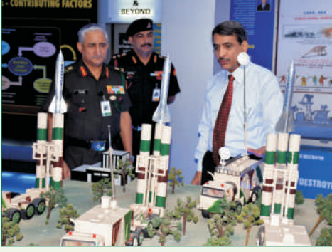
Lt. Gen. PM Bali, , VSM, DG (Perspective Planning), Indian Army