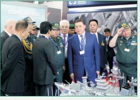
Hi-level Delegation from the Republic of Kazakhstan