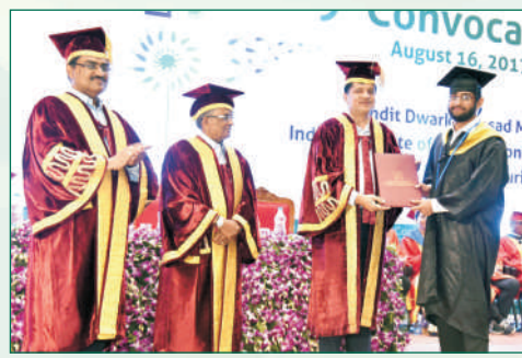
9<sup>th</sup> Convocation Ceremony at PDPM Jabalpur Engineering College, Jabalpur (M.P.)