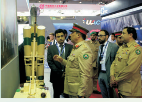
Hi-level Delegation of UAE Army