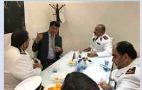
Chief of Navy with his team interacting with CEO & MD BrahMos