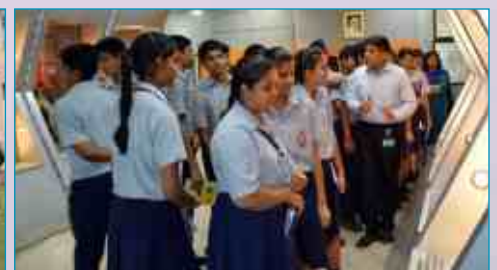
Students from Navy Children School, New Delhi