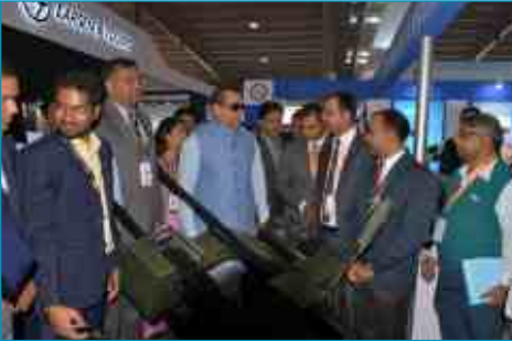
Bollywood actor Shri. Paresh Rawal visited the BrahMos Pavilion on the inaugural day of the exhibition