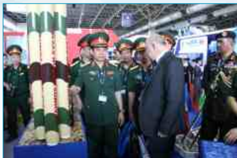
Lt. Gen Phan Giang, Dy. Defence Minister & Chief of General Staff, Vietnam