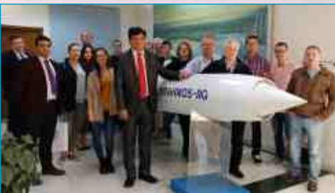
Delegation of Russian Journalists