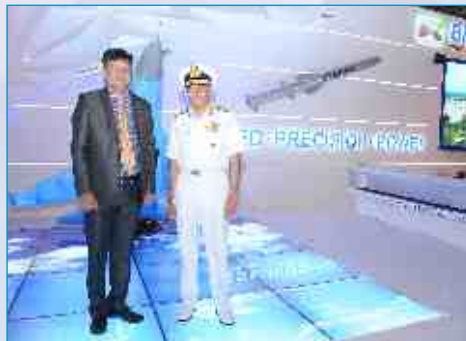
Admiral Sunil Lanba, Chief of the Naval Staff and Air Chief Marshal Birender Singh Dhanoa, Chief of the Air Staff visited on the second day of Asia's Premier Airshow.