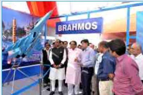
The team of Ministers getting apprised about the BRAHMOS Supersonic Missile and its variants