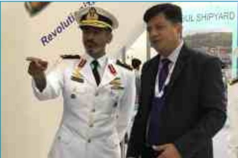
Deputy Chief of UAE Navy being briefed by CEO&MD at BrahMos Pavilion