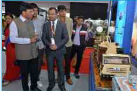
Shri Mansukh L. Mandaviya, Minister of State, Ministry of Chemicals & Fertilizers getting insights of the BRAHMOS Weapon System