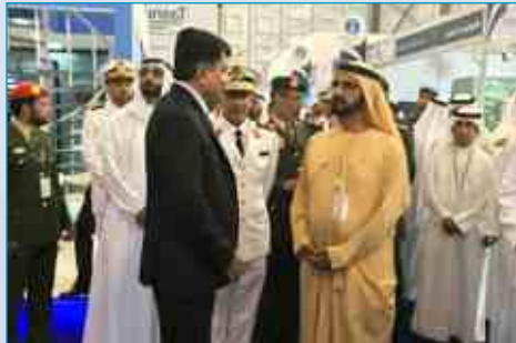
CEO & MD explaining the system capabilities to His Highness Sheikh Mohammed Bin Rashid Al Maktoum, the VP & PM of the UAE and Ruler of Dubai