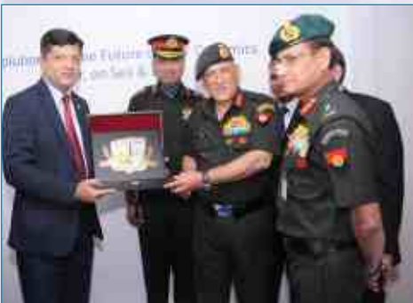
Gen. Bipin Rawat, Chief of Army Staff visited the BrahMos Aerospace pavilion on the opening day of Aero India.