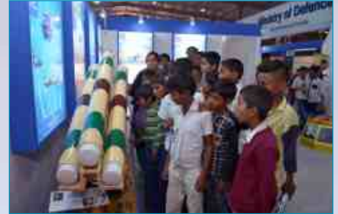
Children and Teachers from Govt. School astonished to see the model of BRAHMOS Mobile Autonomous Launcher and other exhibits.