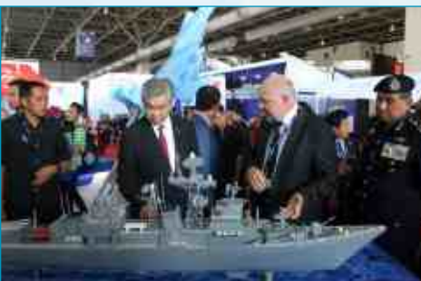
Hon'ble Deputy Prime Minister of Malaysia Y.A.B. Ahmad Zahid Hamidi