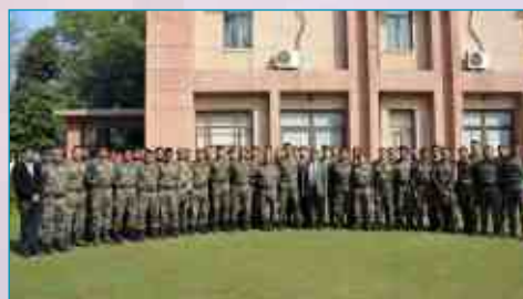
Officers from Indian Army