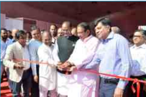
CEO & MD BrahMos Inaugurating the 6th edition of Bhopal Vigyan Mela