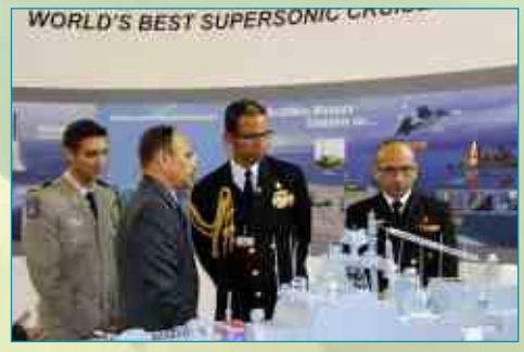
Defence Attache, Peru