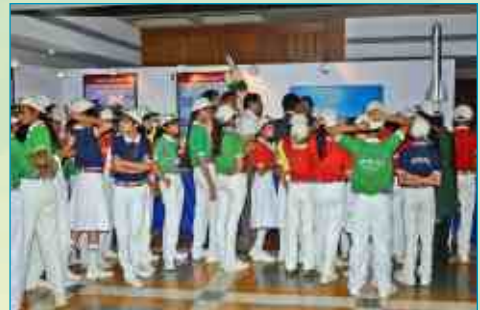
School children visiting the BrahMos pavilion during the DRDO Exhibition