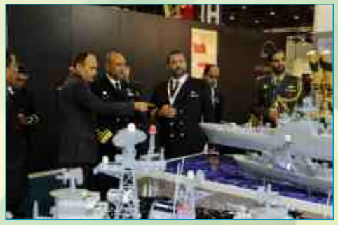
Commander of UAE Naval Forces getting insights about BRAHMOS fitted with Indian Naval Ships