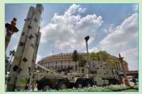
BRAHMOS missile on Mobile Autonomous Launcher of Indian Army