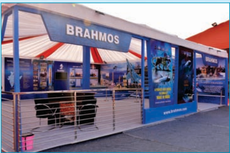
BrahMos Pavilion at the mega Science Fest