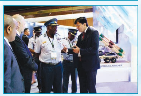
Chief of Staff of Air Force, Zimbabwe getting a briefing on near future flight trials of BRAHMOS from SU-30MKI