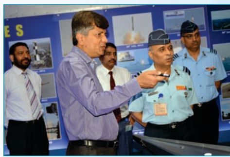
Air Vice-Marshal Sunil Padegaonkar AVSM, VSM, ACAS (Weapons)