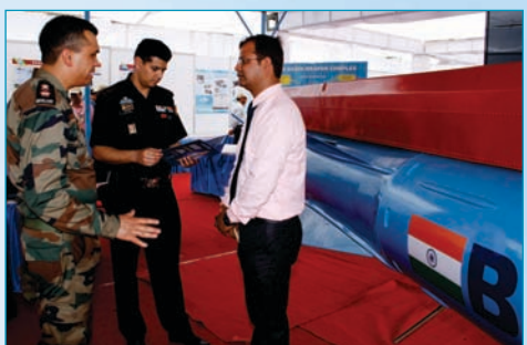
Army officials participating in Iron Fist 2016 exercise getting insights of the BRAHMOS Missile System