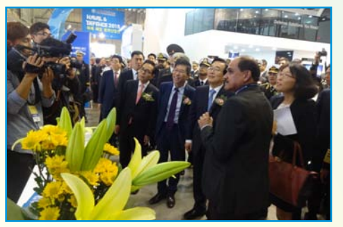
Defence Minister of S. Korea and International Naval Delegations