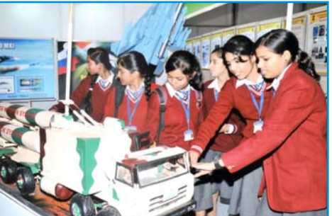
Students from Navjeewan Academy School getting insights of the Mobile Autonomous Launcher